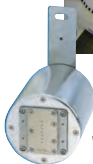
Washdown (IP65 rated), 7 Valve