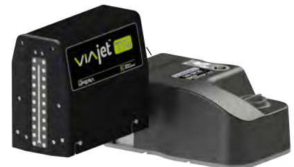
VIAjet™ T-Series T100 Print Head